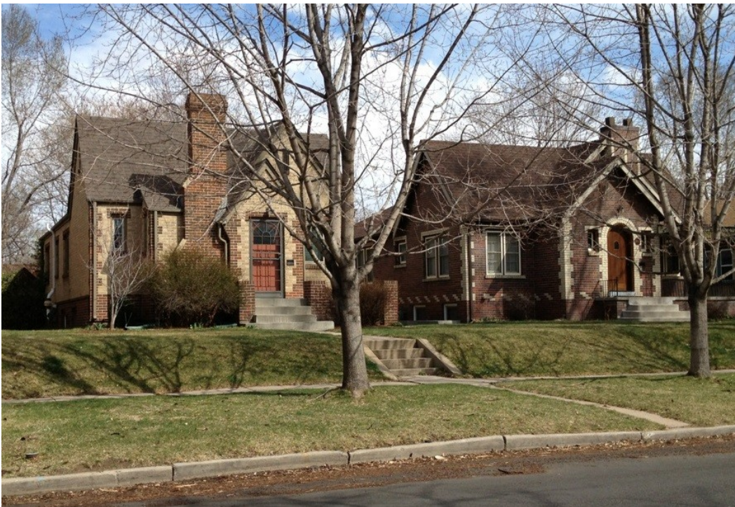
Figure 4. Streetscape of single-family homes built in the 1920s and 1930s, located on the 2000 block of Kearney Street in Park Hill. These houses are located five blocks north of the house in Figure 3.